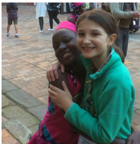
Building new friendships

From February to May 2019, the 100% hOPE Children's Choir will be in Australia again to help themselves and their 114 'brothers and sisters' at the 100% hOPE Village and School in Uganda build better lives and better futures.